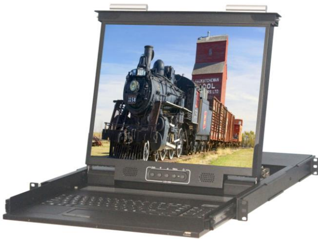
↑ (USB Port for device access)

Optimize rack space. Maximize rack monitoring DVI-D-USB & VGA-USB, Audio, Hub