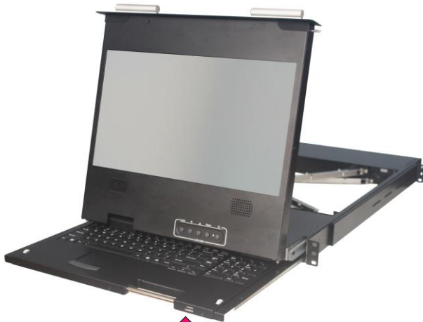
(USB Port for device access)

Optimize rack space. Maximize rack monitoring DVI-D-USB & VGA-USB, Audio, Hub