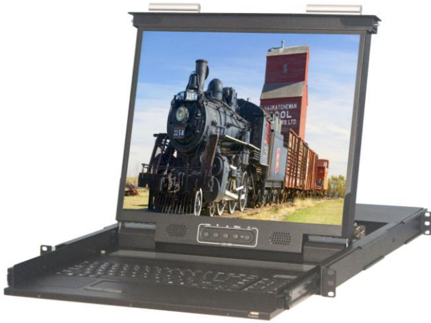
↑ (USB Port for device access)

Optimize rack space. Maximize rack monitoring DVI-D-USB & VGA-USB, Audio, Hub