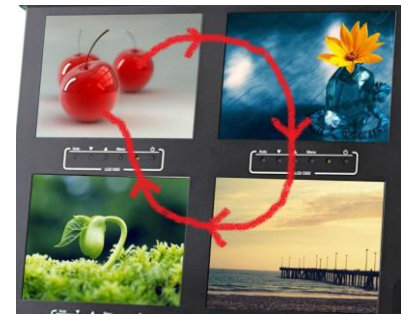
Switching port by simply moving the mouse cursor across each screen boundary

Anso QUAD SCREEN range of LCD console drawers is optimized for low profile (1U height) and design to save value rack space while increasing your video content capacity..