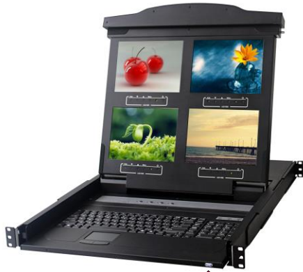
↑ (USB Port for device access)

Optimize rack space. Maximize rack monitoring