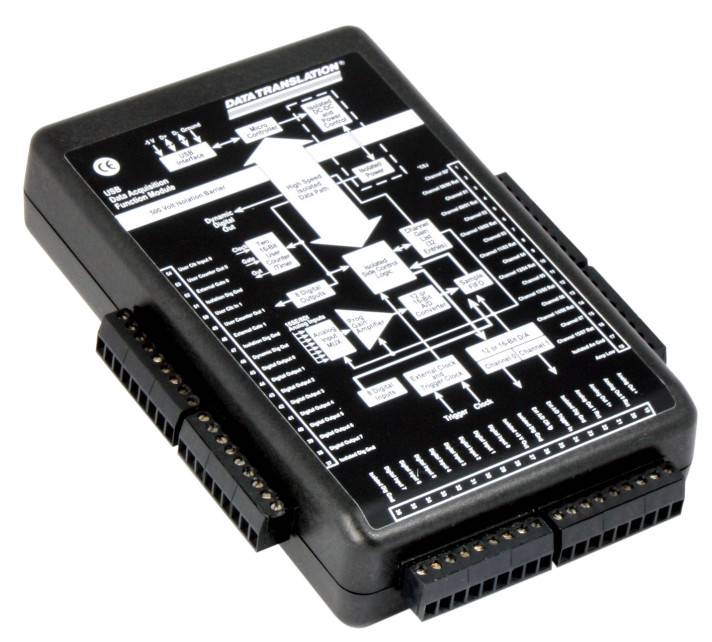
Figure 1. The DT9800 Series is a family of USB function modules for data acquisition.

Computers are susceptible to ground-spikes through any external port. These spikes can cause system crashes and may even cause permanent damage to the computer. The DT9800 Series modules feature 500 Volts of galvanic isolation to protect the computer from ground-spikes and to ensure a reliable stream of data.