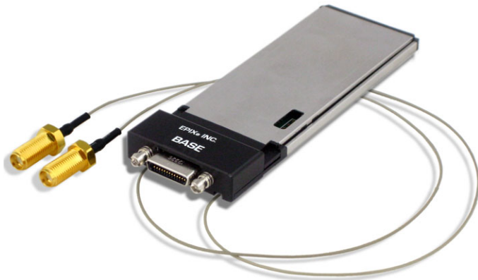
PIXCI® ECB1-34 ExpressCard frame grabber with SDR (mini) Camera Link connector measures 99mm L x 34mm W. Trigger input and strobe output cables, with SMA connectors, are optional.