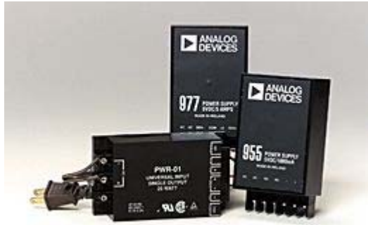
Models: 955, 977 and PWR-01

Models 955, 977 and PWR-01 are chassis mounted AC/DC, regulated, + 5 V dc output power supplies which can be mounted on the rear of Model AC1363 rack mount kit, using mounting screws provided. Since these modular supplies are fully encapsulated, no external components are required - simply mount the unit and connect AC power - using Model AC1340-D power cord (in U.S.A.)- and output leads. Refer to the Power Supply section for complete electrical and mechanical specifications on these power supplies.